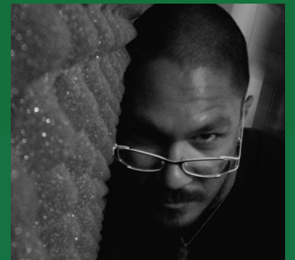
T'aiPu - PuConA

My friends and I hope y'all come ready to make some joyful noise in celebration of our good friends...the folks at N.E.E.D.S.