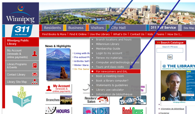
Jan - Feb 2011 issue of @THE LIBRARY

Visit http://wpl.winnipeg.ca/library/ Go to Use the Library Click on For newcomers and EAL