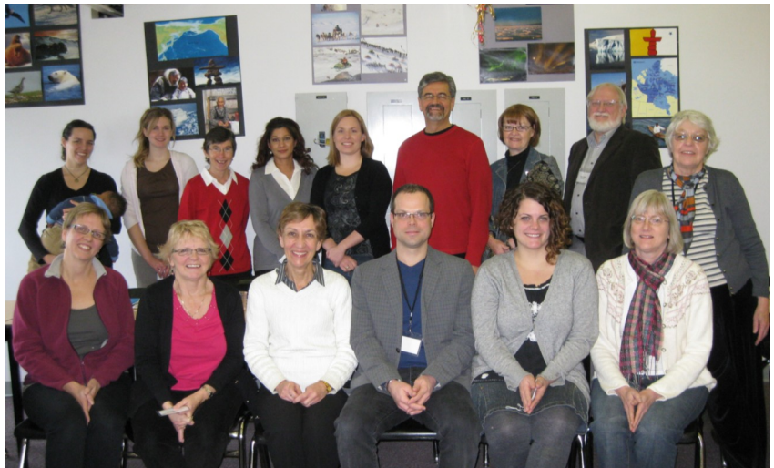
December 2010 Windup